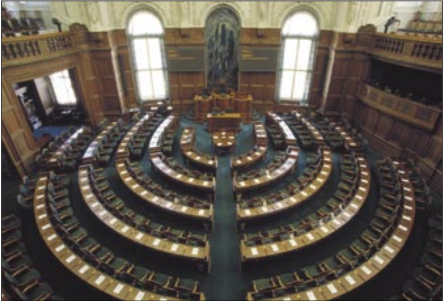
The Danish Parliament