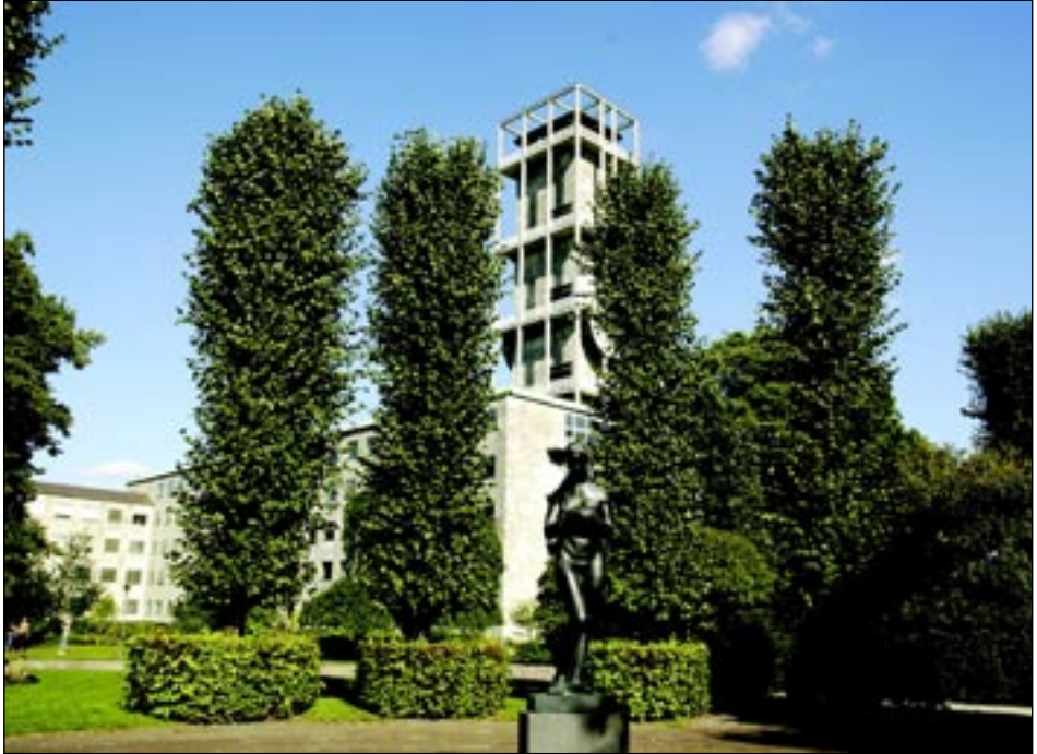
The Town Hall