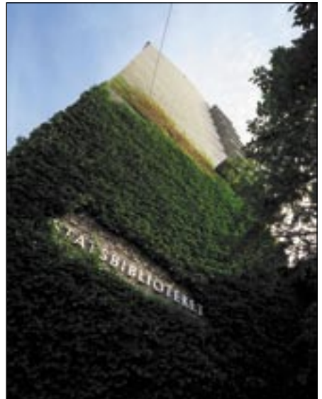
The State Library