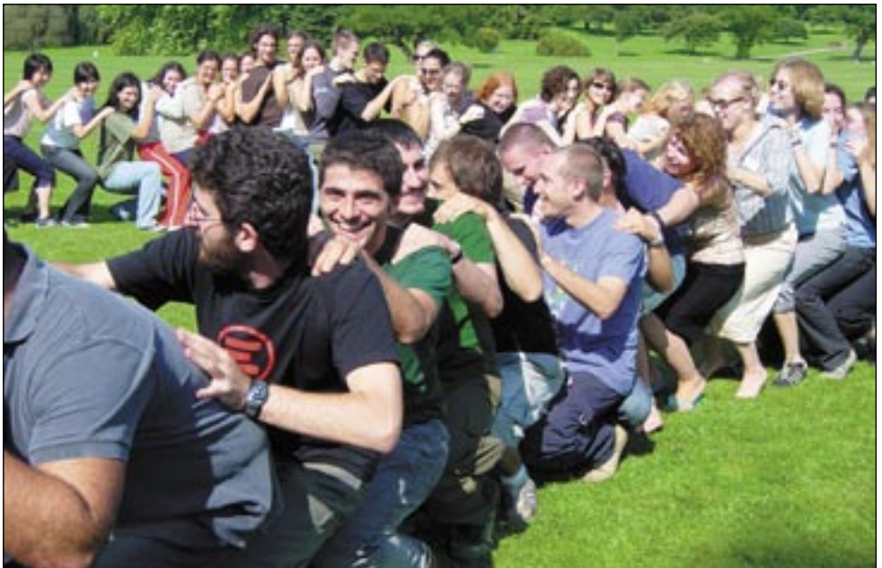
Games in the park

You cannot study without reading a book and you may not afford to