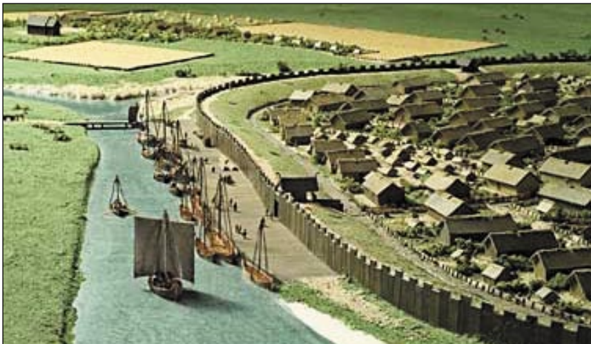
Model at Moesgård Museum of Århus in the early Viking Age